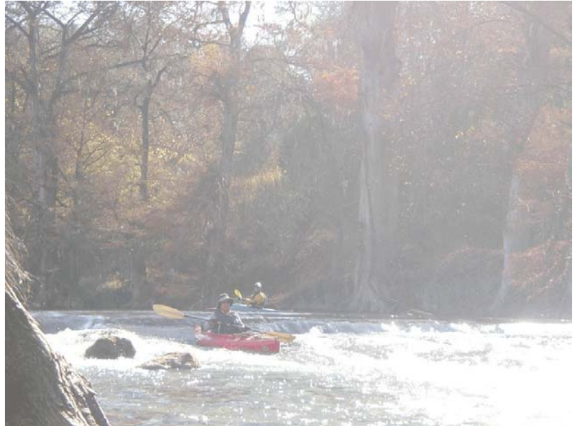
Our own Reiko Seilor going over a small dam on the Upper Guadalupe.

FM 311 crossing - 2 miles southeast of Spring Branch. Access is available on the Highway right-of-way. (1 mile)