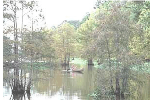
What we're missing.

There will be no Angelina-Neches Forks trip October 8-10. When the government administers an area, you have to expect decisions will be made because somebody sitting at a desk somewhere thinks it will look more like he's doing his job if he issues edicts. Hurricane Rita took out the electricity and other utilities from the area around the Angelina-Neches Forks, so the Army Corps of Engineers has closed the entire area to the public--even though where we were going never had any electricity or other utilities.