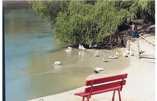
Fisherman's Park Take-out