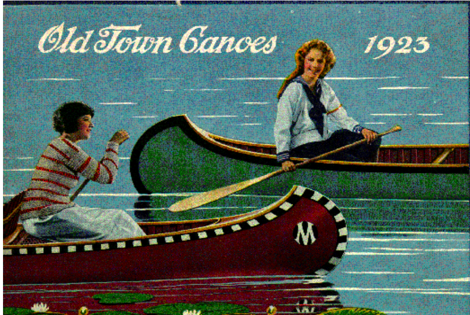
1923 Old Town Catalog