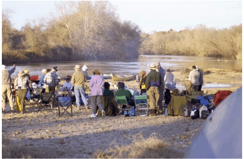
From Freeze Trip 2001

If conditions are absolutely miserable, such as continuous rain or extremely strong winds, we are planning on doing the cook out and campout at Pecan Park (512-392-6171) in San Marcos. Tom Goynes has granted the Alamo City Rivermen a Temporary Special Dispensation on the Wine Grog since it involves Acts of God in conjunction with water and wine. The decision to move the location to Pecan Park will be made at FM 969 about 10:30 AM by all paddlers present on January 24.